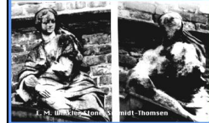
Acid Rain Effects on Sculptures